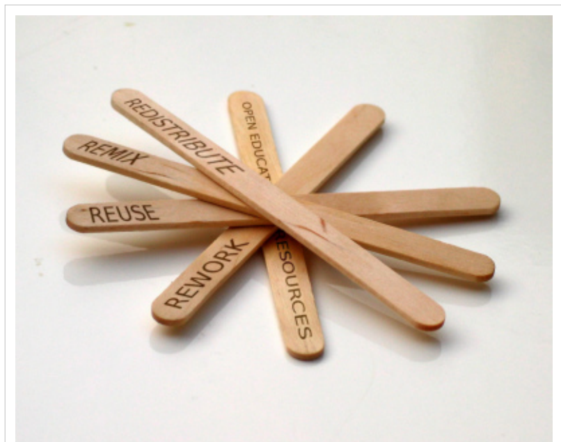
Thinking about OER

A precise definition of OER impinges on the range of opinions regarding fundamental questions associated with interpretations of the meaning of the freedom to learn, for example: