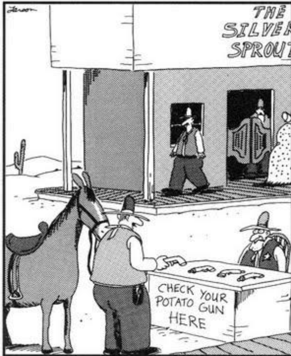
Vegetarian towns of the Old West

Vegetarians are cruel, unthinking people. Everybody knows that a carrot screams when grated. That a peach bleeds when torn apart. Do you believe an orange insensitive Two thumbs gouging out its flesh? That tomatoes spill their brains painlessly? Potatoes, skinned alive and boiled, The soil's little lobsters. Don't tell me it doesn't hurt When peas are ripped from the scrotum, The hide flayed off sprouts, Cabbage shredded, onions beheaded. Throw in the trowel And lay down the hoe. Mow no more Let my people go!