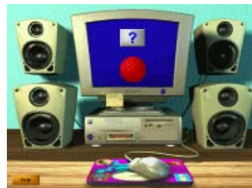
Word Chopping (syllable segmentation) test

LASS Junior is a multifunctional assessment system designed for children aged 8-11 years. LASS is straightforward to administer, with students completing up to eight “games”. A report is immediately available which is easy to understand and explain to parents and other staff. The report shows student attainment levels in aspects of literacy as well as cognitive readings on visual, auditory memory, phonological skills and non-verbal IQ. The Teacher Manual suggests strategies and resources in response to the reports. Pre and post testing allows teachers to measure over time how effective interventions have been.