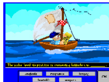
Sentence reading test

In New Zealand, these tests can be ordered from a small number of suppliers including Lexia Learning Systems: www.lexialearning.co.nz or www.itecnz.co.nz , and the Learning Staircase: www.learningstaircase.co.nz