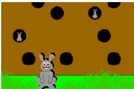
Visual sequential & spatial memory test

Lucid CoPs , released in 1996, is the leading computerised assessment system for children aged 4-8 years. A scientifically proven system for early screening of dyslexia, it is currently used by more than 6,000 schools in the UK and worldwide – including more than 300 New Zealand schools. CoPS comprises nine tests of fundamental cognitive skills that underpin learning. They enable teachers to produce a cognitive profile of a student which can greatly illuminate the individual pathways to learning success. Each test is presented as an enjoyable game. Lucid CoPs assesses the student's strengths and weaknesses in dealing with information presented in a variety of visual and auditory modalities. Suggestions for a wide variety of teaching strategies are also included.