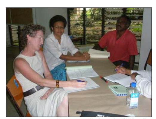
Photo 2: Course writers attending a workshop in DFL print course design

Although we focus here only on English and skills print courses, it is paramount that once these compulsory courses have been shaped properly, then its students can be comfortable with their shield of fluent English in pursuing other distance courses and completing them satisfactorily.