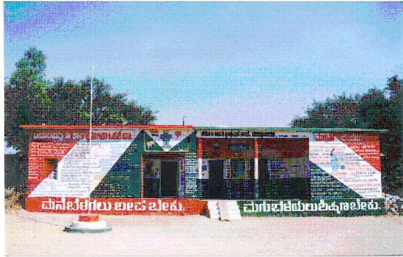
An attractive government primary school.