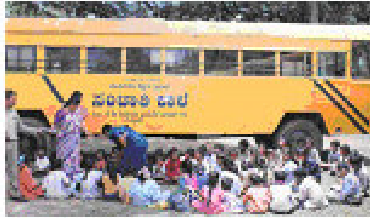
Mobile school: Alternative school providing education to children of slum and construction workers deprived of education