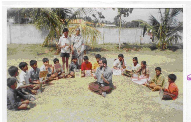
Environment education for children in "Chinnara Angala" centre