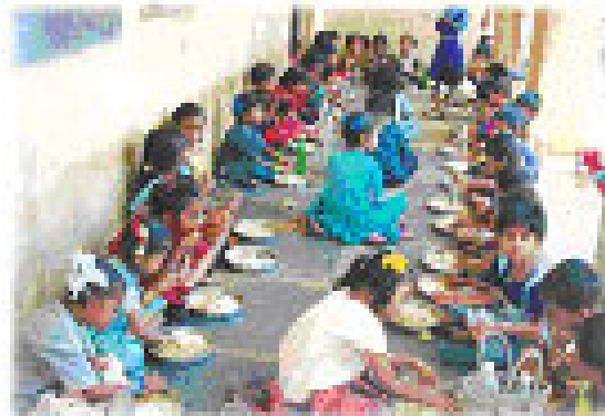
Akshara Dasoha : Midday meal programme for all government primary school children