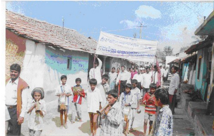
Students, teachers and community members engaged for enrollment campaign