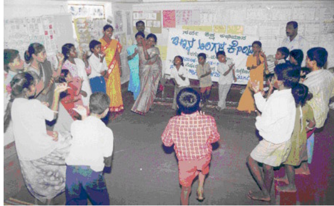
Teachers and children engaged in a "child song" sequence in "Chinnara Angala" centre