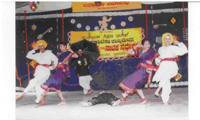
"Prathibha Karanji" : School children in drama competition