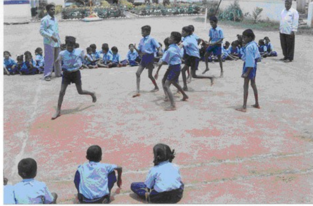
Children who have participated in Sports competition