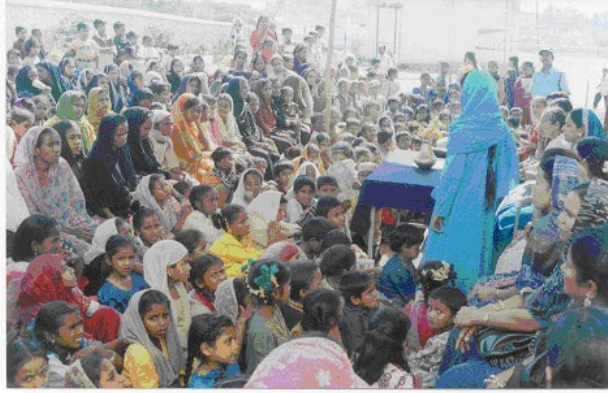
Child labourers who have returned to school through "Cooliyinda shalege" programme