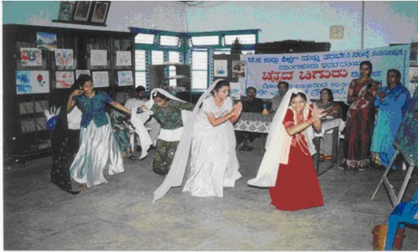
"Chaithrada chiguru" group dance by schoolgirls in summer camp