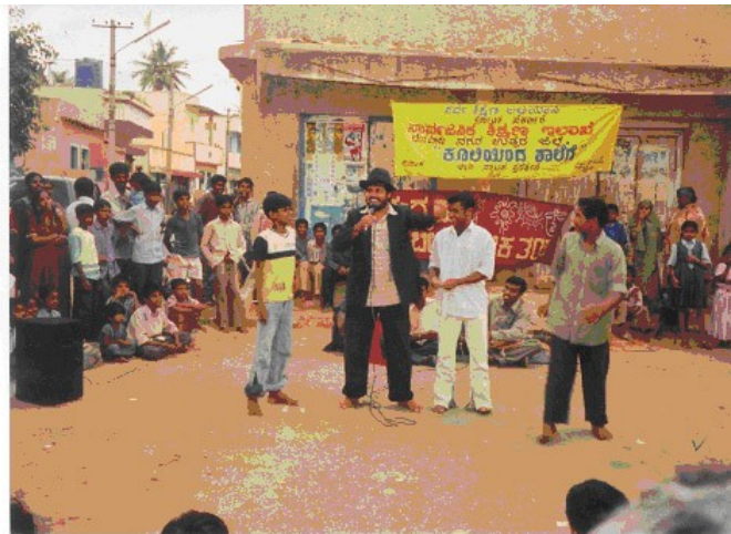
"Cooliyinda shalege" (wage earning to school learning) : A programme of public awareness on bringing school dropouts into mainstream of education