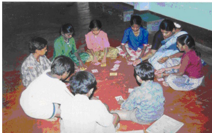
Children participating in "Chinnara Angala" centre for learning activities