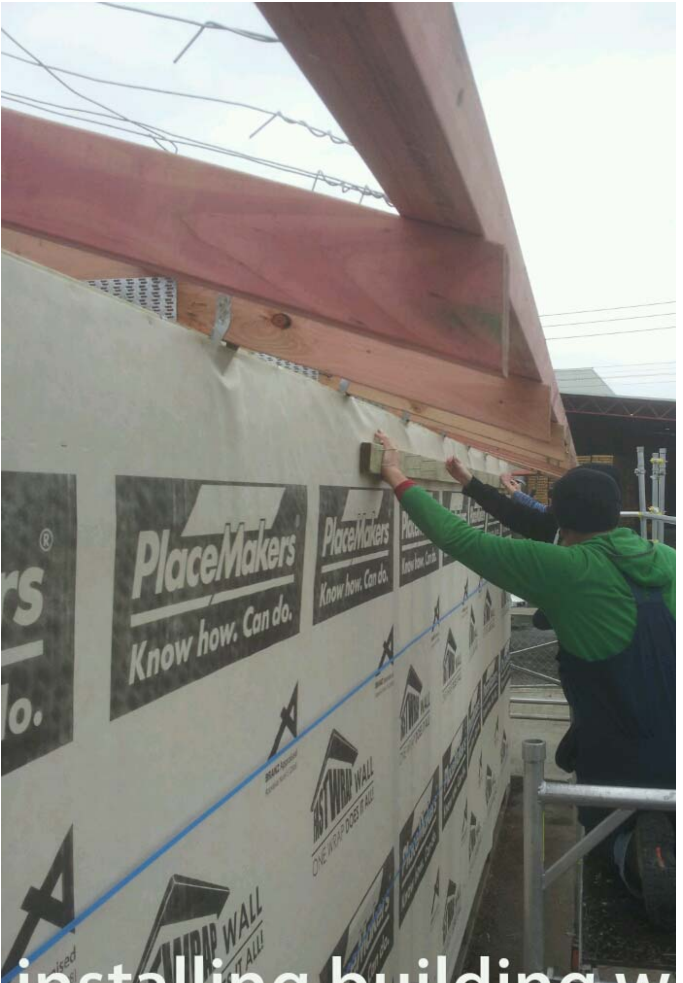
installing a building wrap