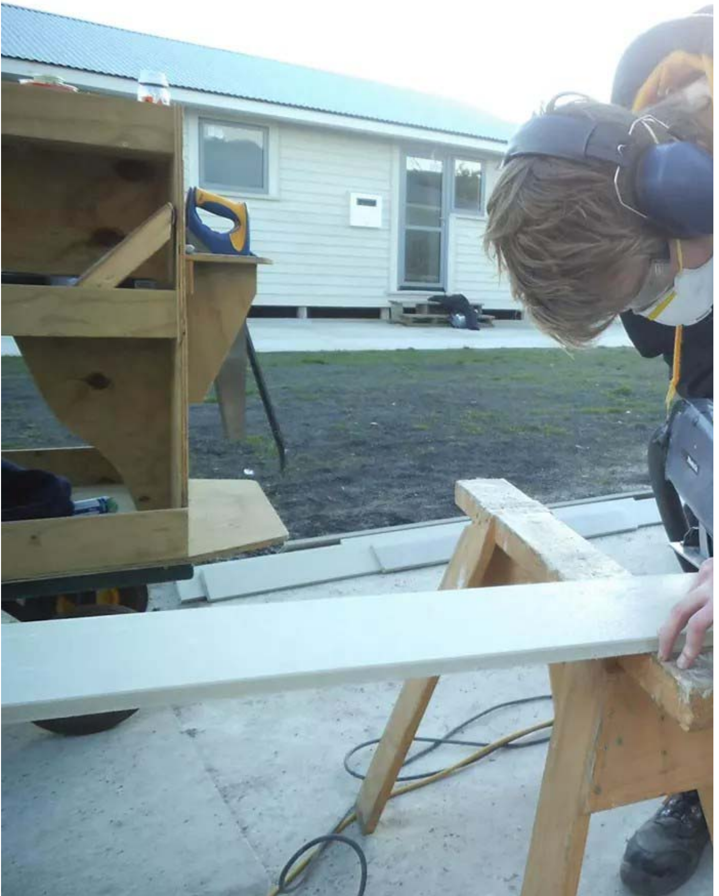
Here we were cutting the weather boards. Correct blade had to be used as it is a fibre cement board. Also dust mask ear muffs and glasses had to be used.