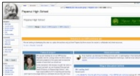
PAPANUI'S PORTAL PAGE HTTP://WIKIEDUCATOR.ORG/PAPANUI_HIGH_SCHOOL