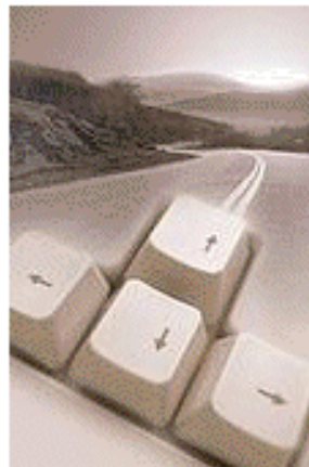
Introduction to the Super-highway