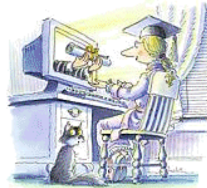
Certification for Teachers