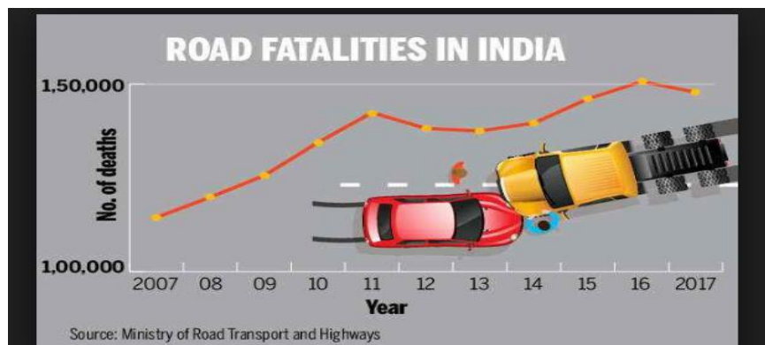
Road Accidents Trends on Delhi roads

The road accident trend has been shown in the figure: [3]