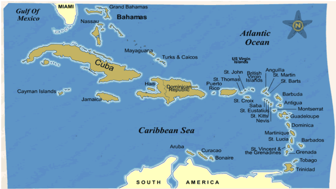
Map. 1.1 The Caribbean